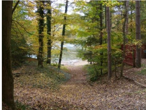
Fall leaves on the way to the beach.

Only 8 months until the summer of 2014! Work hard to do well in school and plan to join us for another excellent summer.